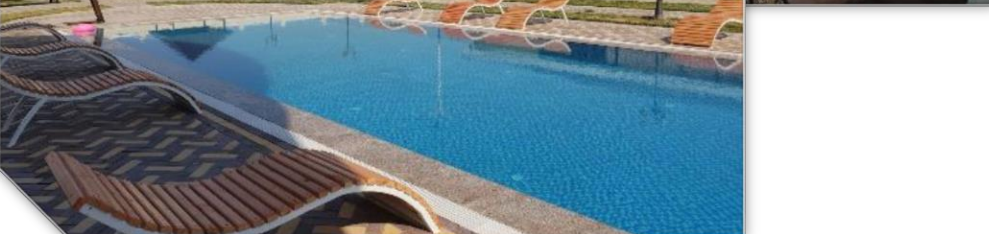
Training Center of the General Prosecutor's Office of Tajikistan Guliston, Sogd Province, Tajikistan

Business Center “Asyl Tash”, Ibraimov Str. 115/1, 700021, Bishkek, Kyrgyzstan Email: secretariat@project-leica.eu Tel: +996 222 406723