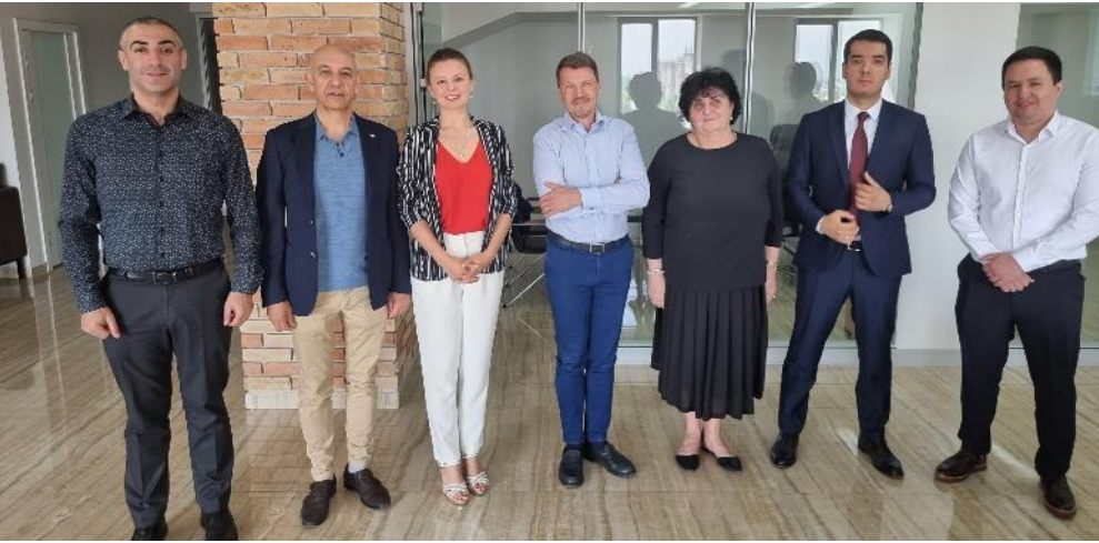
Hosting CBRN CoE in LEICA office. Bishkek, Kyrgyzstan